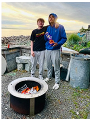
Tyee boys enjoying a fire at the beach after their camp work day.