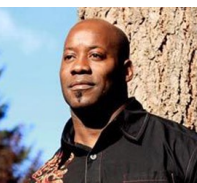
Christ the King Bible Fellowship