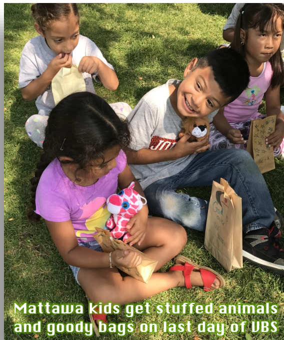
Mattawa kids get stuffed animals and goody bags on last day of VBS