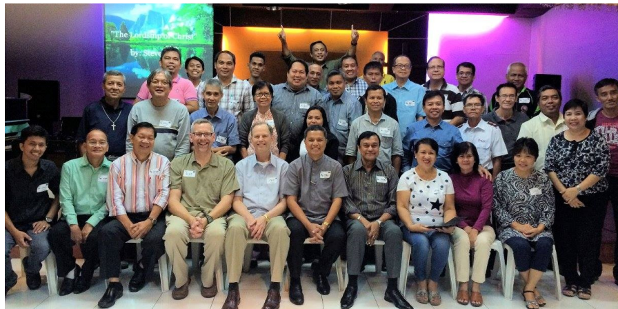
Leaders of the Philippine Council of Evangelical Churches. They serve 32,000 Filipino churches.